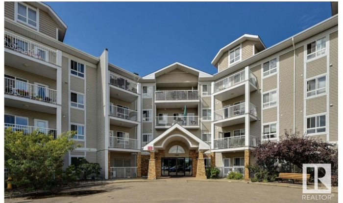
328-5350 199 St NW, Edmonton, AB