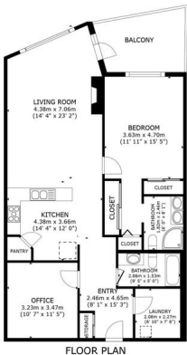
#203-9708 110 ST RIVERVIEW GREEN WIKWENTOWIN, EDMONTON

GROSS INTERNAL AREA FLOOR PLAN: 105.00 m 2 (1,115 sq. ft.) TOTAL: 105.00 m 2 (1,115 sq. ft.) SIZES AND DIMENSIONS ARE APPROXIMATE, ACTUAL MAY VARY