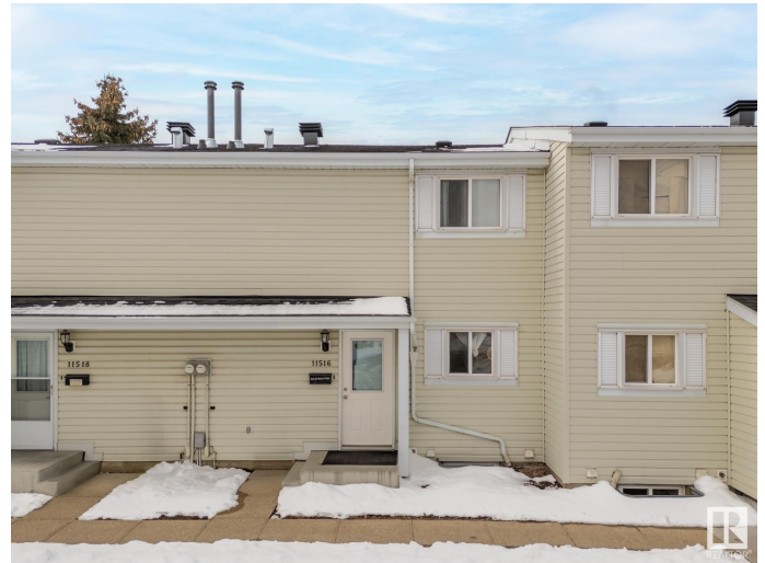
11516 139 Ave NW, Edmonton, AB